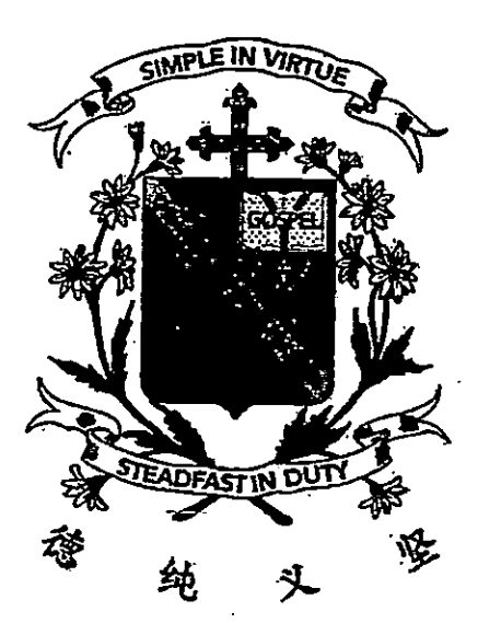
Primary 3 Semestral Assessment 2 26 October 2015