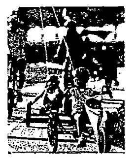
Children having fun on pedal cycles