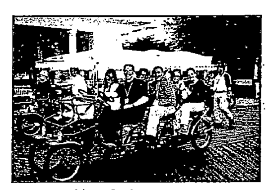
A happy family on a surrey